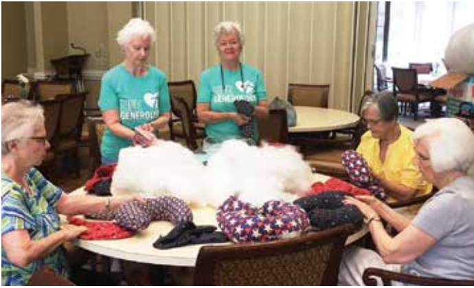
Columbia residents volunteer to stuff pillows as a ministry to the troops.