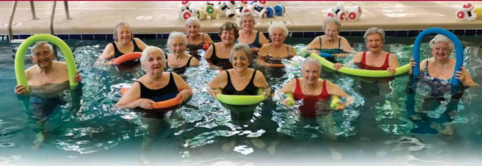
Everybody in the pool is having a great time during exercise class!