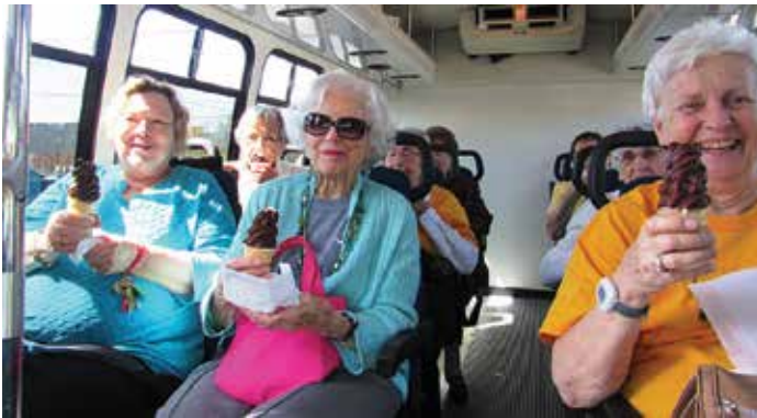
Following a visit to its sister community, Laurel Crest, Columbia residents cool off with a stop at Zesto's.