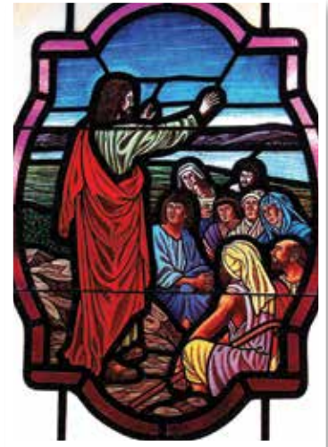
Jesus' Sermon on the Mount is portrayed in one of the new stained glass windows in The Chapel at Foothills, shown below.