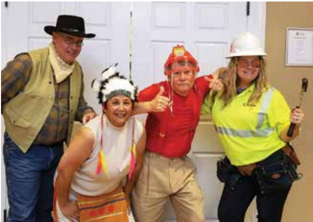
Laurel Crest Life Enrichment staff dressed as the "Village People."