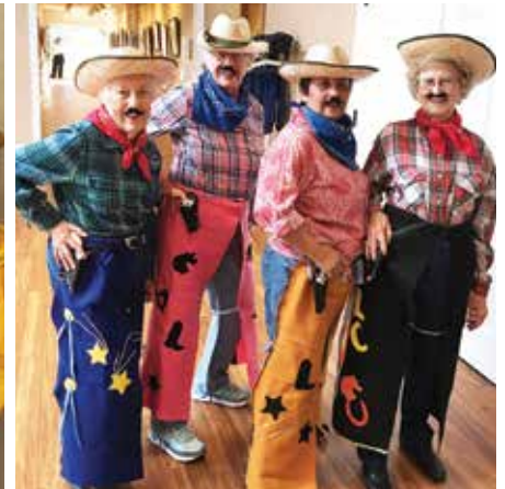
Our ladies saddle up to dance to "I Wish I was a Cowboy."