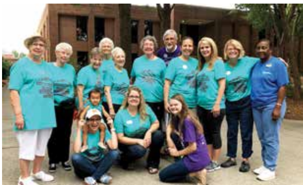
Residents and staff from various PCSC communities turned out to support the Foothills cycling team.