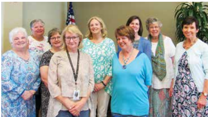
Above: Members of the Hannah Circle of Seven Oaks Presbyterian Church.

For several years, the Presbyterian Women of Seven Oaks' Hannah Circle have held a Mother's Day Tea for the women in residence at the Columbia Community. This is a special time of remembering and appreciating mothers that the residents look forward to each year.