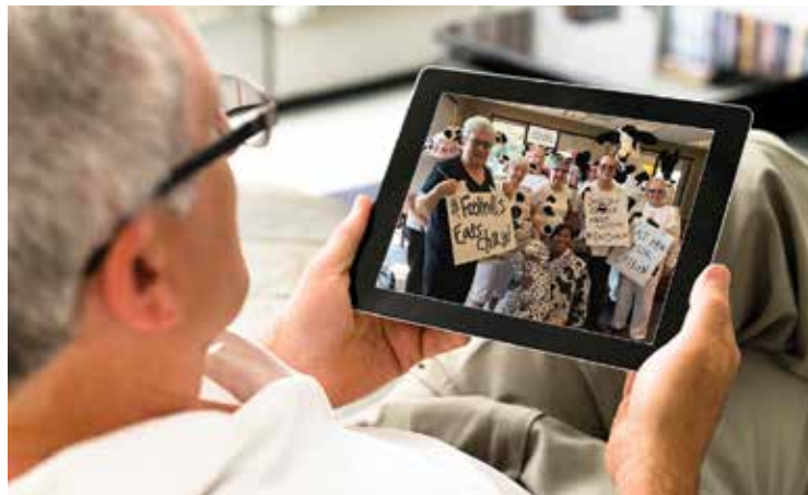
Residents of the Foothills Community recently visited their local Chik-fil-A dressed in cow costumes and shared it on their Facebook page!

PCSC has been active on social media since January of this year, using the platform to build public awareness of its ministry and providing a closer, better-informed community for its residents, staff and families.