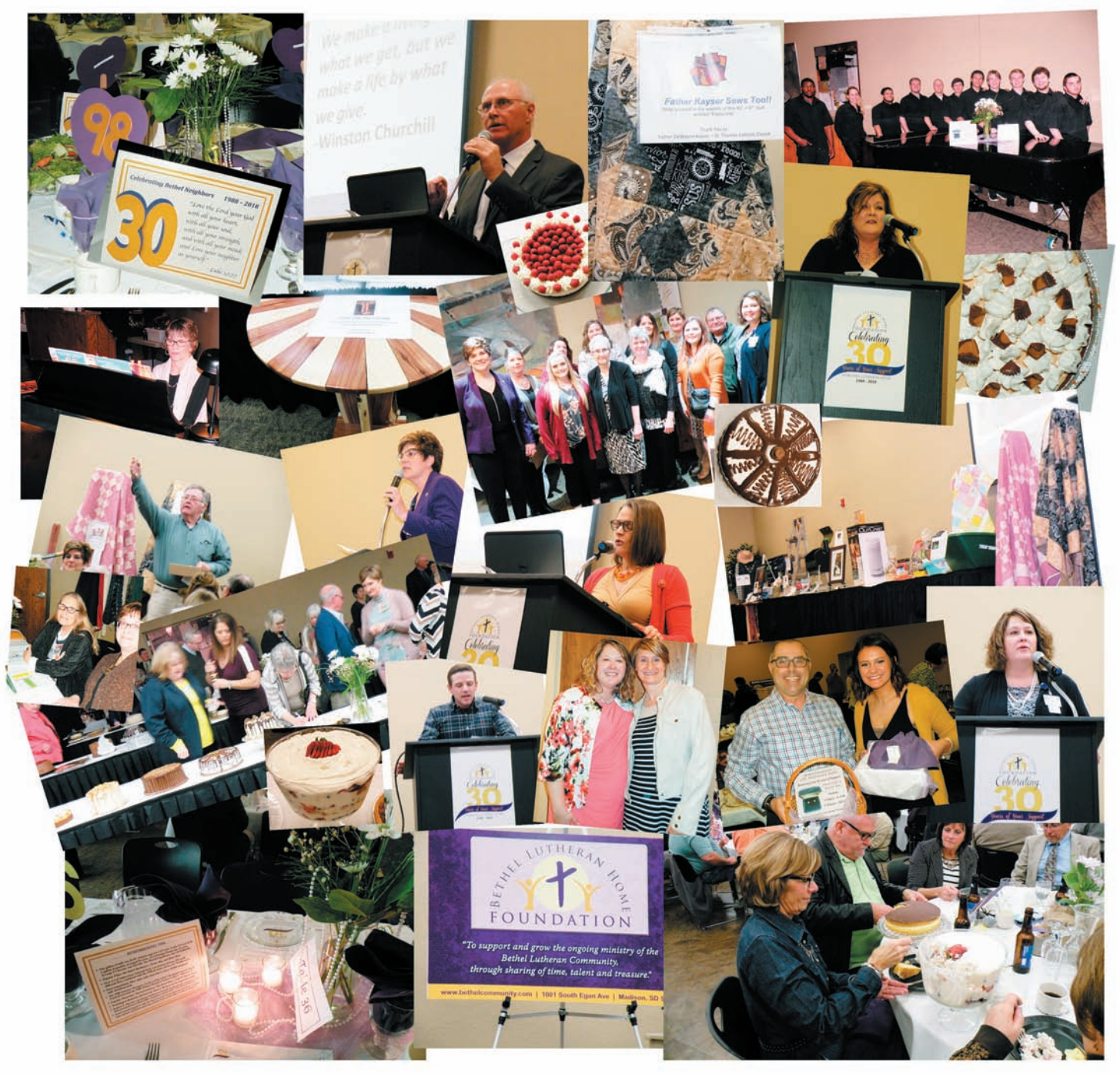
Thank you to everyone involved who helped to make the 22nd Annual Bethel Foundation Dinner and Auction a success!

Bethel residents benefit from the generosity of this community of friends as you support your Bethel neighbor.