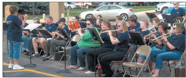
Madison Community Band

take part – the ice cream family social to musician visits and Prairie Village Tractor Parade as a part of the Steam Threshing Jamboree. Throughout the year Bethel residents have a variety of happenings to be involved and projects to do. Stop by anytime for a visit and a cup of coffee ... you will enjoy your time at Bethel!