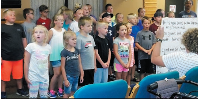
Trinity Lutheran Church Day Camp children sang for residents.