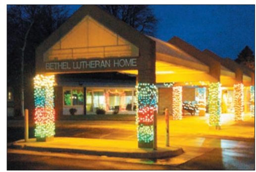
Bethel Lutheran Home entranceway aglow to welcome everyone throughout the season.

Left – The Foundation Christmas Tree adorned with cards recognizing loved ones with a Christmas gift to the Bethel Foundation. Thank you for your geneoristy during the season of giving.