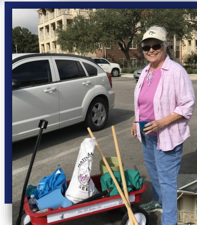
The garden club sowed 10lbs of bluebonnet seeds. Our hill will be beautiful come spring.