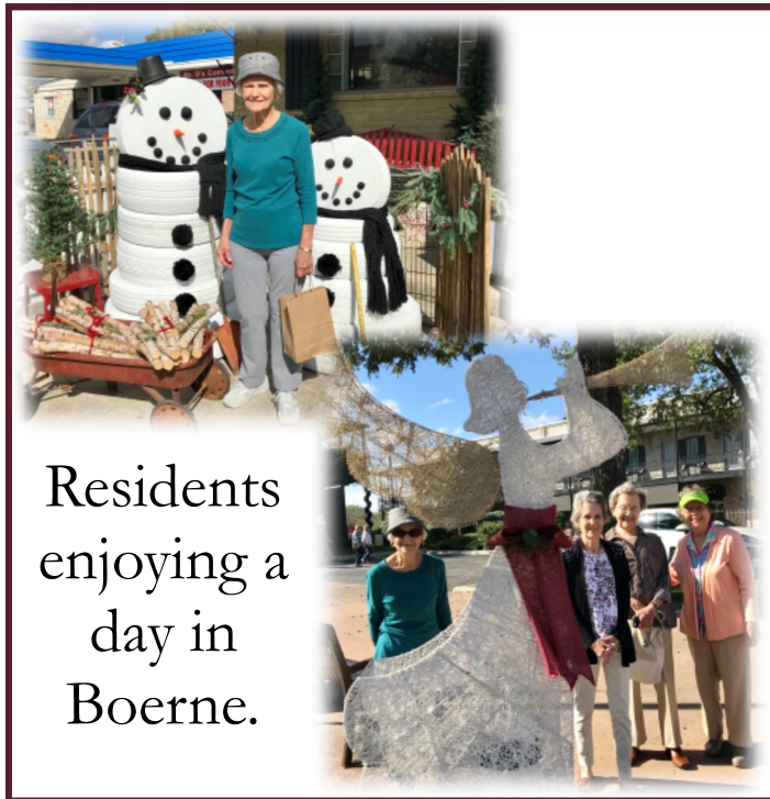
Residents enjoying a day in Boerne.