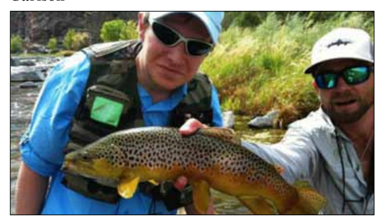
Fly Fishing Float Trip for 2 with Dragonfly Outfitters at Crested Butte, Colorado. Comes with $250 Visa Card for Lodging/meals.