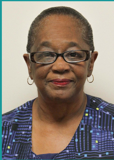
DORIS PIEROTT MEDICAL RECORDS APRIL 2018