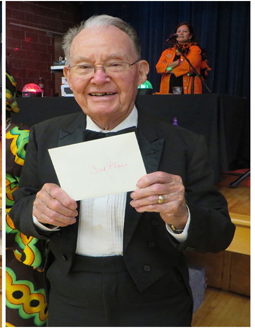
3rd Place Winner "Groucho Marx"