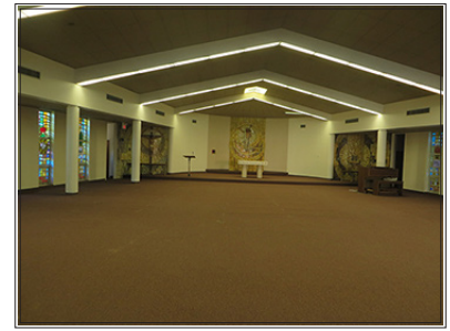
Warren Chapel, before the renovations (above)