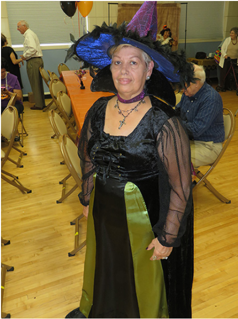
1st Place Winner "The Witch"