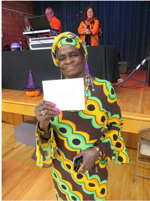
2nd Place Winner "The African Queen"