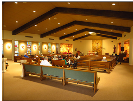
Warren Chapel, after the renovations (left)