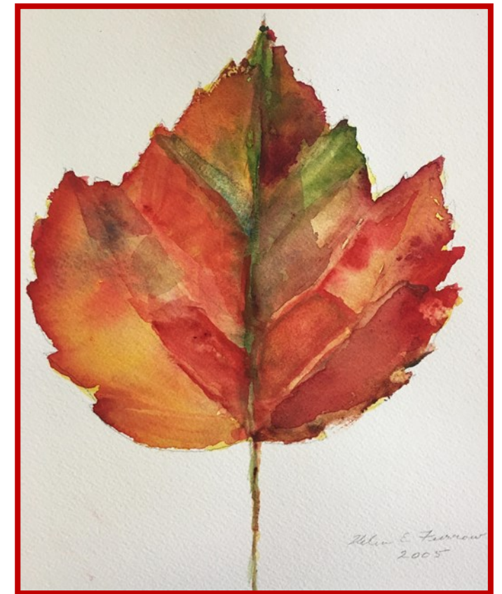
Painted by Resident Helen Furrow. See the original in the art room (5th floor).

A fallen leaf is nothing more than a summer's wave goodbye.