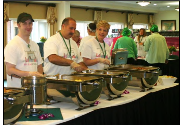
Staff Members Serve It Up