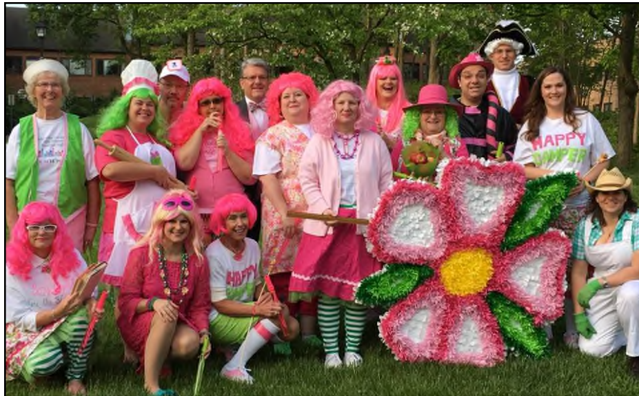
Staff Employees in Apple Blossom Costumes