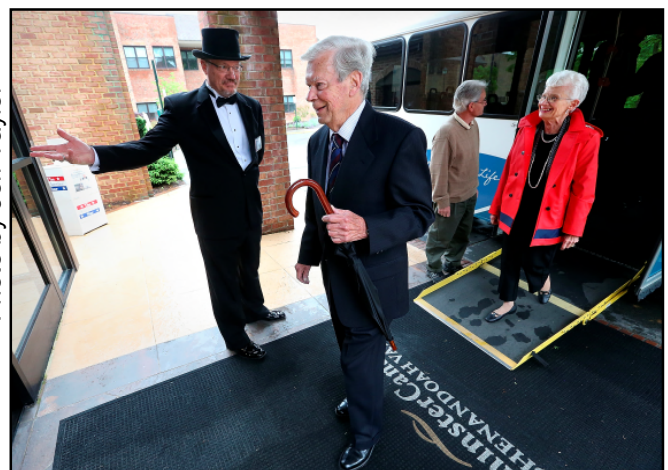
Welcome to the Gala