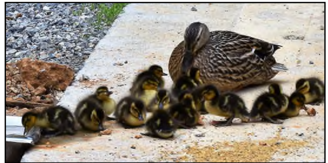
An Annual Blessed Event at SVWC