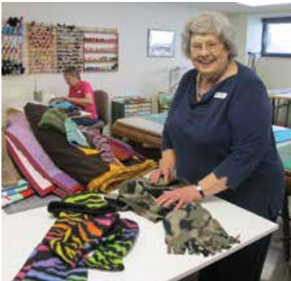
The Sewing Room will benefit from a new air filter.