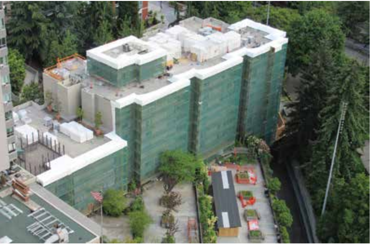
North side, West Wing façade remediation

The second major project is the remediation of the 30-year-old exterior of the West Wing. The entire north side of the building has been scaffolded and tented, and there is plastic covering all windows on that side. Repair work started on the roof back in April, and at this time, we’re well into exterior stucco demolition on the north side. To mitigate the effects of construction noise and dust, we’ve got respite activities, including quiet rooms reserved for West Wing residents and a variety of bus outings. Construction is suspended for a half hour at lunch time during the week and on weekends, and residents are once again able to enjoy the outdoors on the C and D level patios. Once work is complete on the north side, which we estimate will be this coming December, the entire process will be duplicated on the south side of the building. It’s likely that we’ll get scaffolding up in September, a couple of months before the north side is finished. In its entirety, we anticipate the project will take 13 months. Once completed, we’ll have a West Wing that is more energy-efficient, environmentally sound, and more visually integrated with the rest of the Horizon House complex.