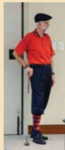
More golf in the future, too.