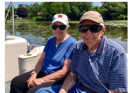
Pontoon Rides down Sawyer Creek