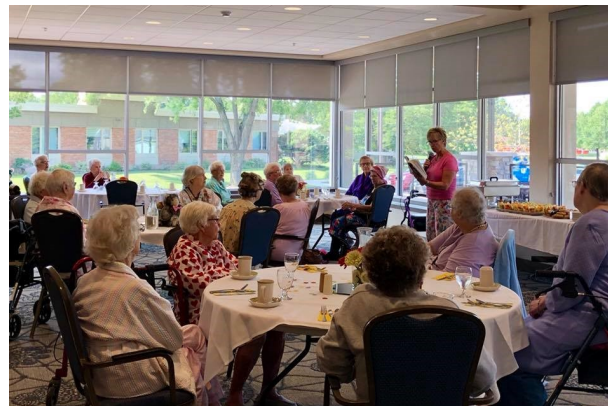
Lemonette's PJ party in the FireSide Lounge