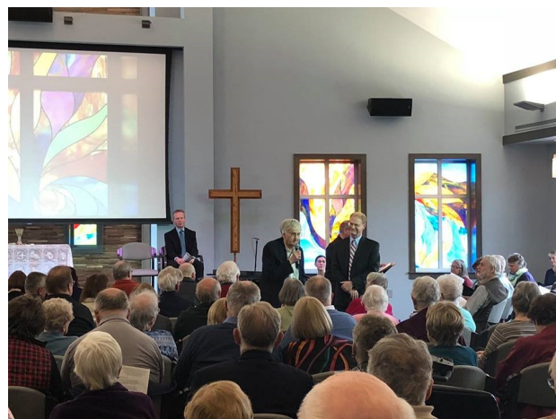
Dedication of the WPAC