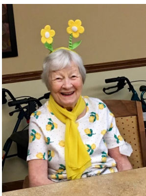
Lemonette's get together