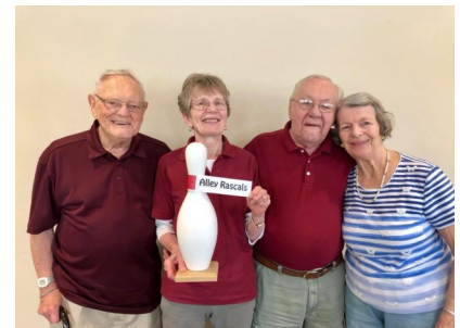
2018 Wii Bowling Team