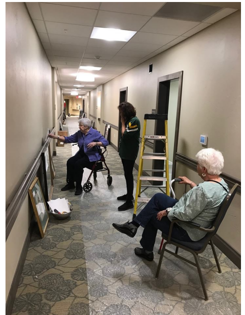
The Art Committee hard at work