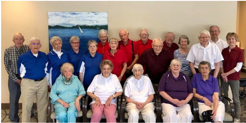
Wii Bowling Teams 2018