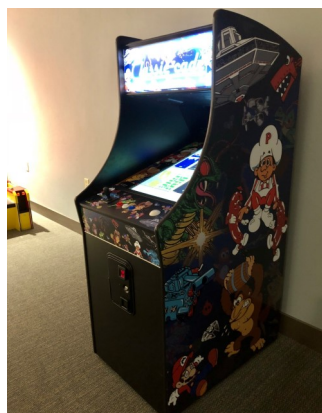
Arcade Game housing over 60 different classic games.