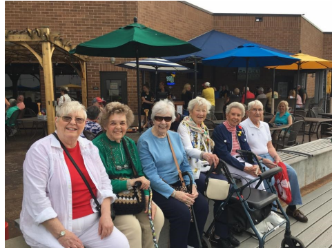
Food & Follie to Ground Round