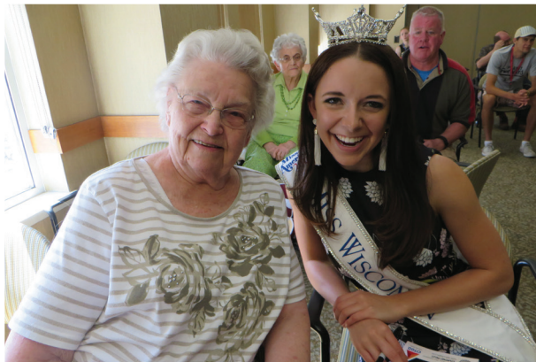
▲ Miss Wisconsin pays a visit to Milwaukee Catholic Home for State Fair Week