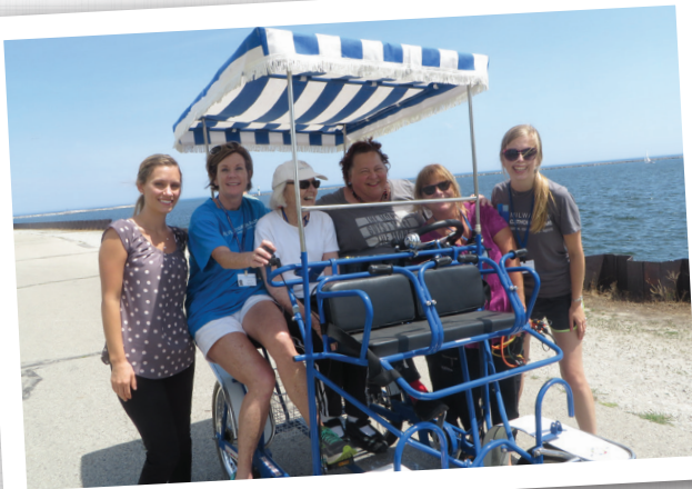
▲ A surrey ride by the lakefront at our annual picnic