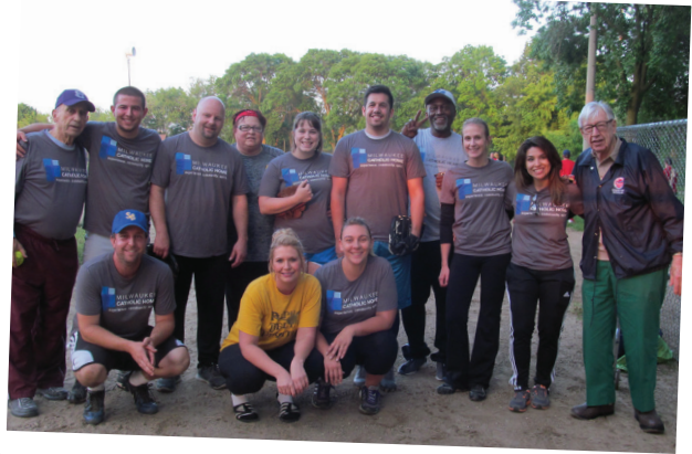
▲ The MCH employee softball team and resident coaches