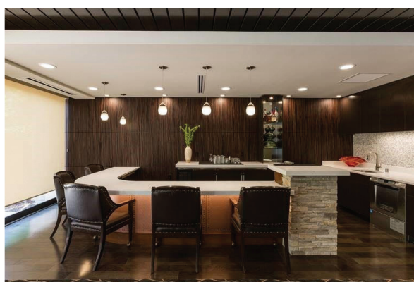
▲ The space was designed by Groth Design Group

The space is open for residents and families to enjoy at any time, and the bar is open for business Tuesday – Saturday, 4:30 pm – 6:30 pm. We'll see you there! ■