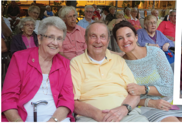
▲ Residents at Patio Pops