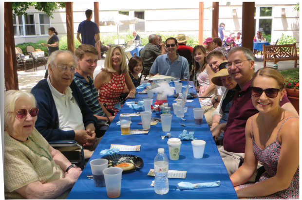
▲ Father's Day cookout in the Health and Rehab Center courtyard