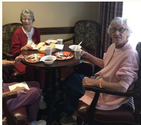
Above: The ladies eating apple butter in the pub.