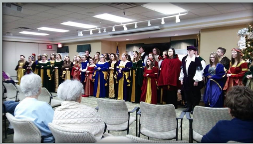
Cabell Midland Collegium Musicum