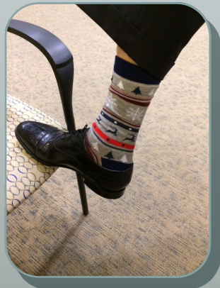
Residents celebrated the holidays in style!