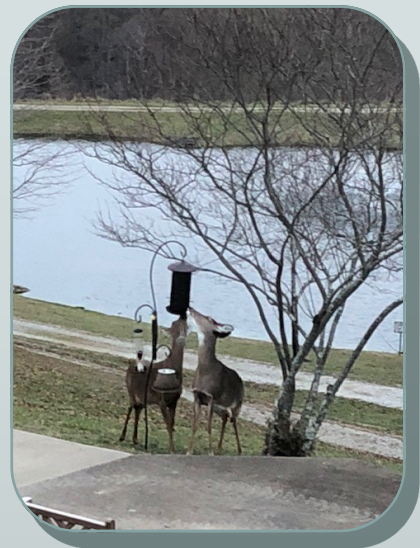
No one goes hungry at Woodlands!