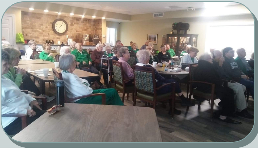
Residents spending time together in the Woodlands Bistro for a Thundering Herd watch party!