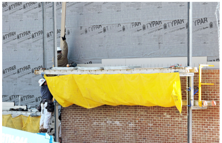
Siding goes up on the ALMC.