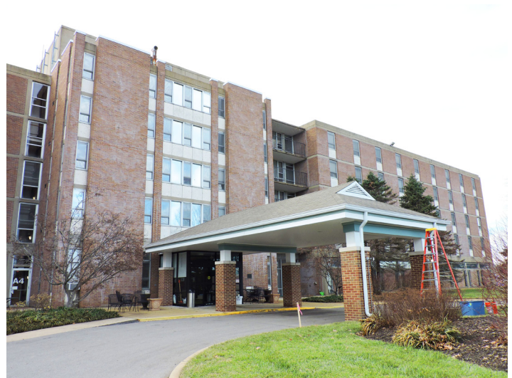
The new building will replace Gleason Hall, which dates to 1965.