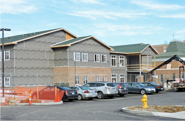
The new ALMC (pictured) and nearby McGovern are served by a new parking lot.