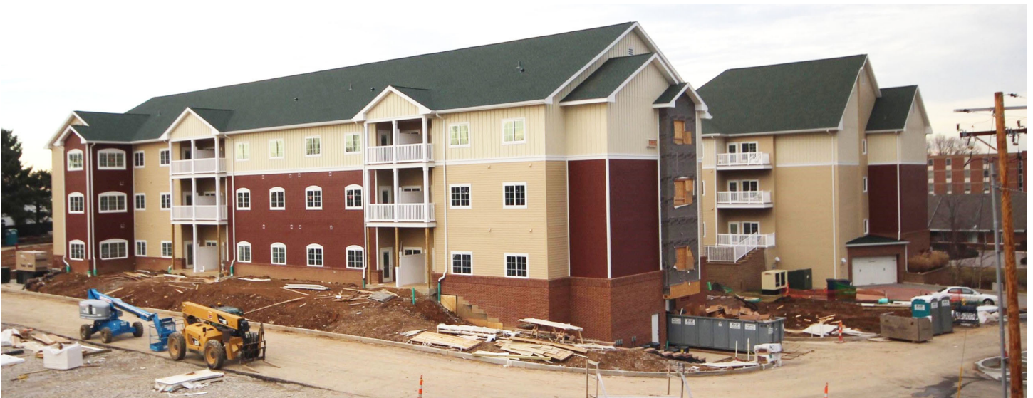
Jan. 18 webcam image of the new Village building.

Great progress is visible everywhere you look