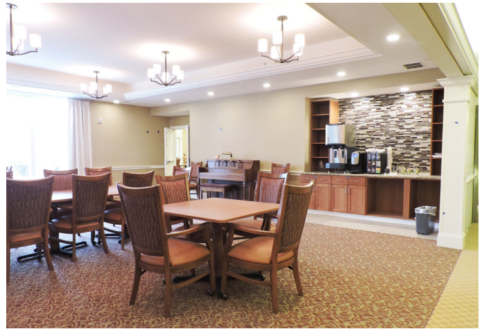
A dining room (pictured) has been renovated and new Bistro constructed in Village I.