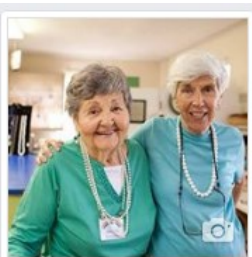
East Ridge at Cutler Bay Foundation @EastRidgeCutlerBayFou ndation