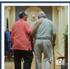
The Terraces at Bonita Springs Foundation @TheTerracesBonitaSprin gsFoundation