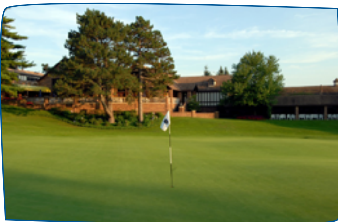
Indianwood Golf and Country Club in Lake Orion Michigan to host Golf for Lourdes 17th Annual Event.

Plans are under way for the 17th Annual Golf for Lourdes on Tuesday, June 12th, at the prestigious Indianwood Golf & Country Club, 1081 Indianwood Road in Lake Orion.