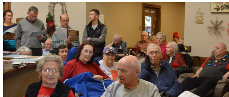
What a festive Christmas Eve event —caroling with the Beery Family and gift distribution!