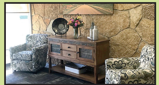
Cozy First Floor Gathering Area