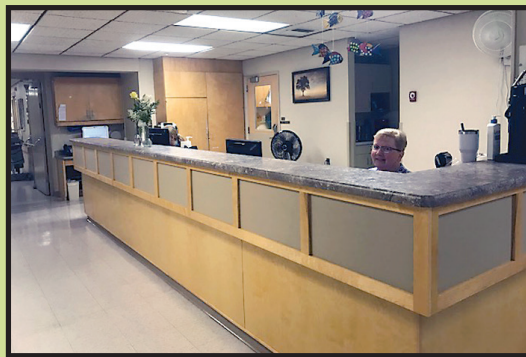
Remodeled Second & Third Floor Nursing Stations

With the plans to construct a new building already drawn, we still recognize the need do some minor face lifts in the meantime to make Lakeview feel more like your home.