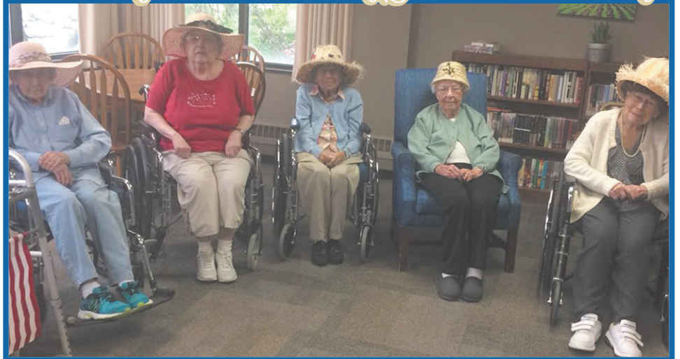
Some Of Our Residents Enjoyed Watching The Royal Wedding In True British Fashion!