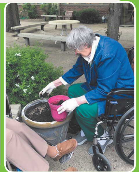
Residents Enjoyed Time Outside On Our Patio Planting Flowers In Our Raised Beds.