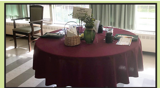
New Linens In Dining Room