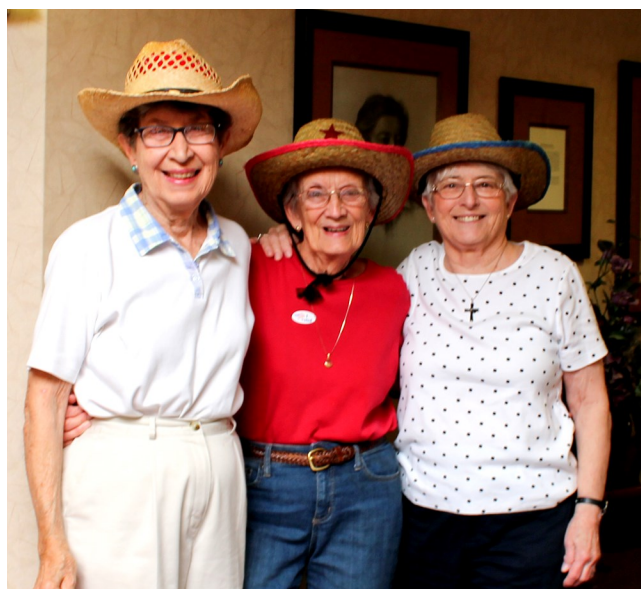
Our Fearless Pony Riders!!!